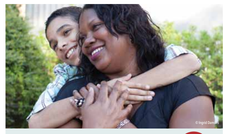
HOW YOU CAN HELP: United for a common vision

Our work cannot happen without the key partnerships