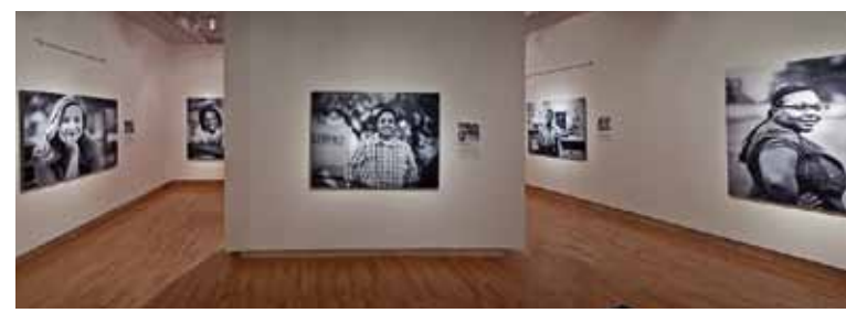
ONE in THREE